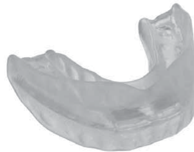
(Fig 3) Custom moulded mouthpiece